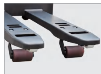
Entry roller for easy operation