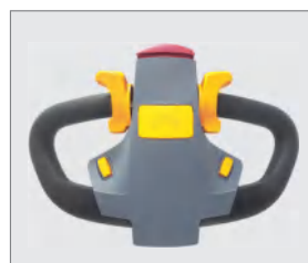
Frei tiller head with two lifting button (option)