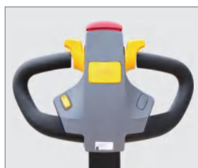
Frei tiller head with one side lifting button (option)