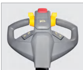
RUYI Handle (standard)